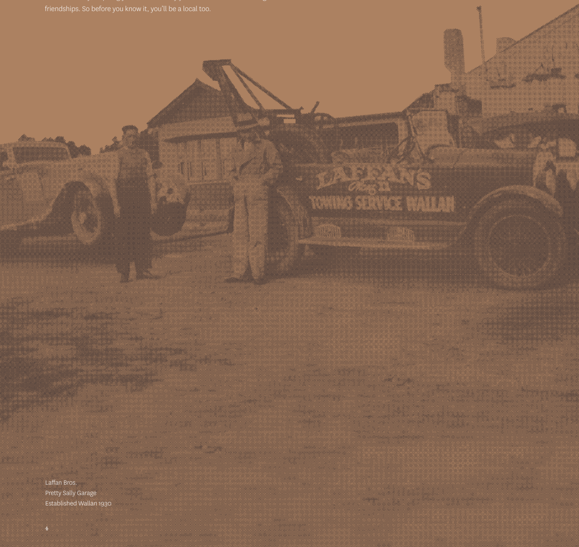
Laffan Bros. Pretty Sally Garage Established Wallan 1930

Here, local businesses that have been handed down through generations happily work alongside newcomers who very quickly have become part of the community, inspiring you to live the way you want and to build lasting friendships. So before you know it, you'll be a local too.