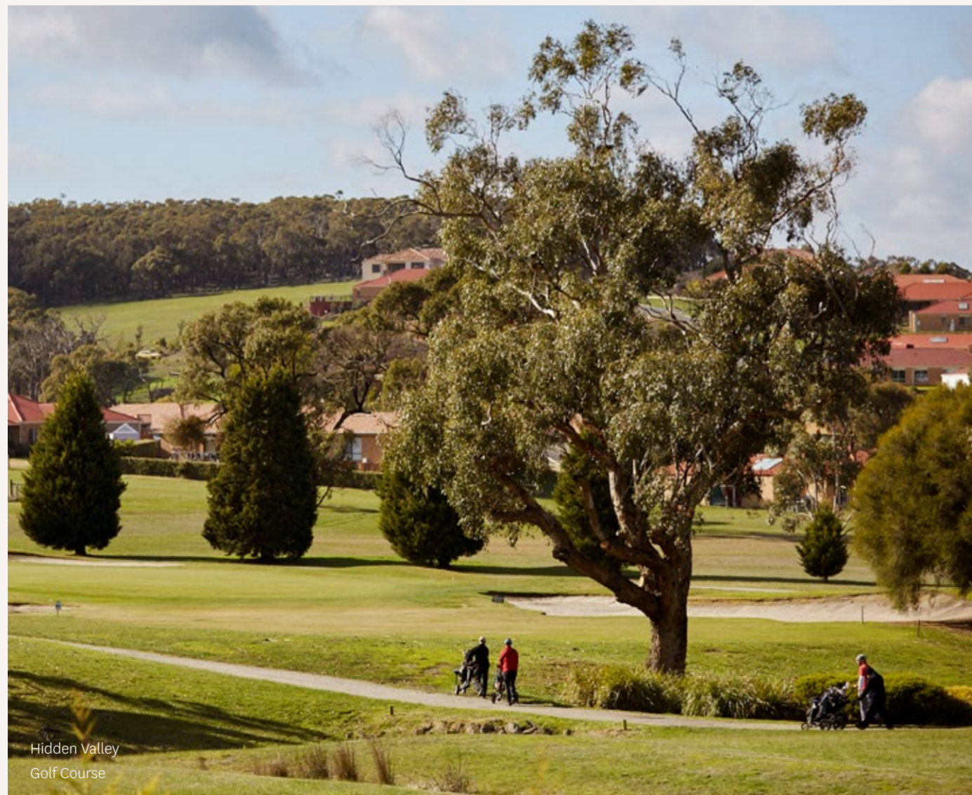
Hidden Valley Golf Course

The Wallan Football and Netball Club is a big part of the local community with teams for all ages, right up to the senior reserves. Join and get active.