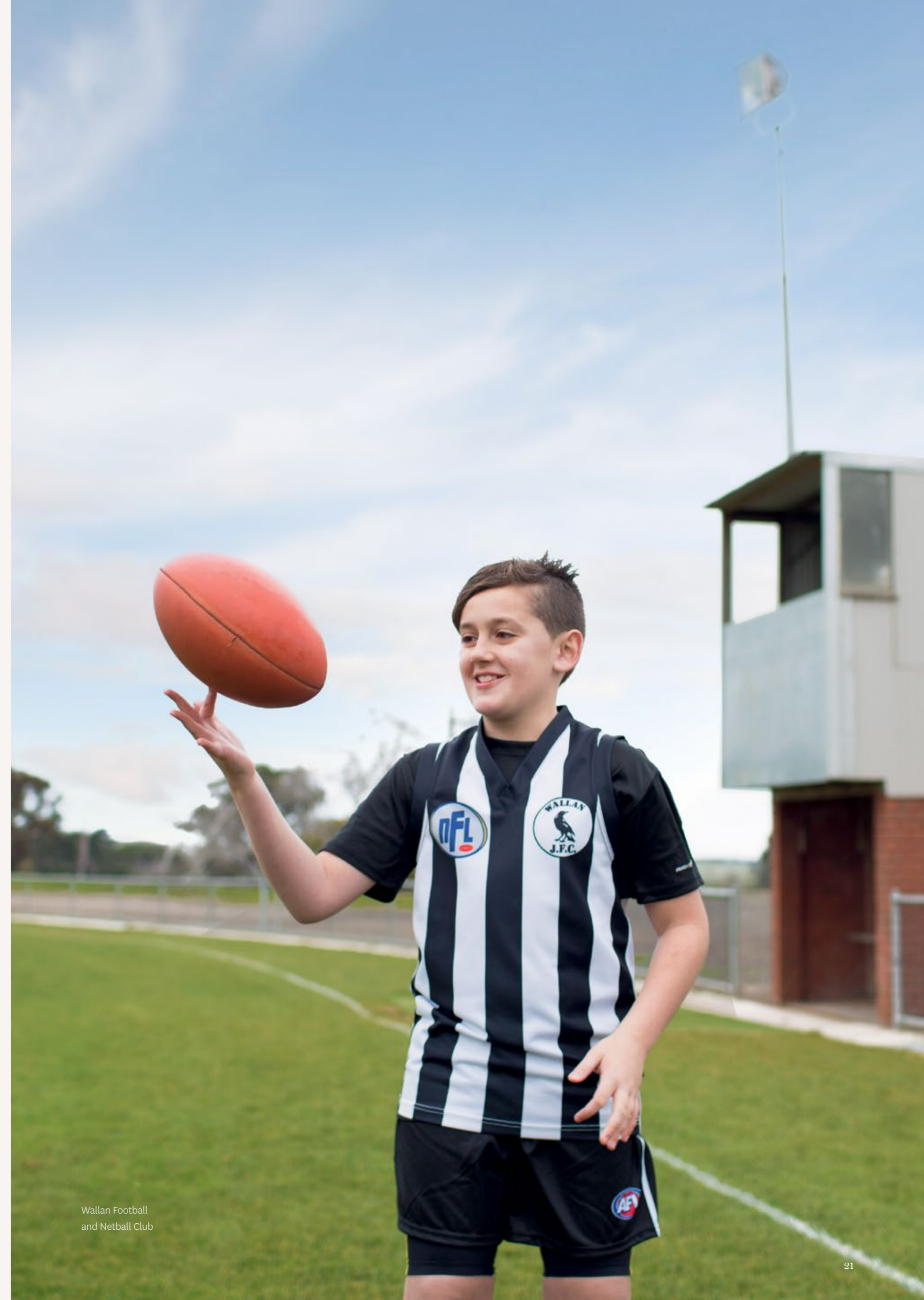
Wallan Football and Netball Club