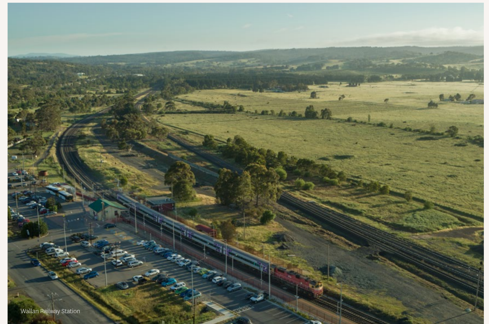
Wallan Railway Station